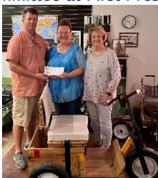
Check presentation on July 29th, 2024.

The Mission Committee at First Presbyterian Church