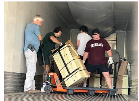
Once on the truck, the carts are unloaded from the pallet and stacked neatly, side by side, row after row.