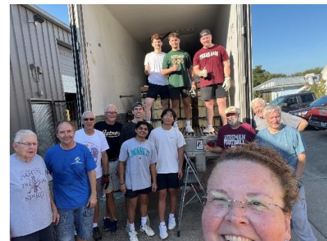
Look at how fresh we still look! This load was accomplished in only 1.5 hours.

Note: Our board of directors has pledged $10,000 as matching funds! We hope to raise at least $20,000 to cover building and shipping expenses for a third shipment of carts. Our shop has been averaging two shipments a year.