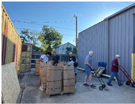
Six carts are placed on a pallet, allowing the forklift operator to easily lift them onto the truck.