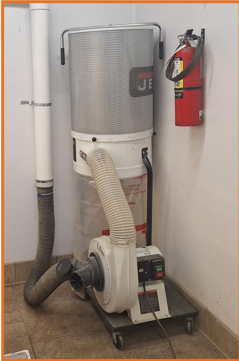
This dust collection system will help keep sawdust out of the air in the shop.