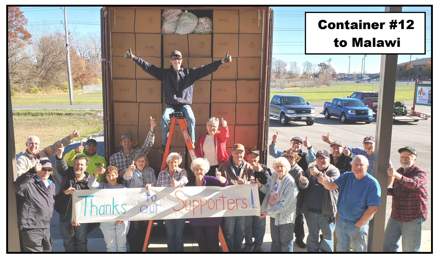
Wheatfield, IN — On November 14 after loading this 40 ft. Container, our volunteers watched the truck drive off with

230 boxed mobility carts, 47 pairs of crutches, and several hundred Days For Girls kits. It was a beautiful, sunny 54 degree day and the packing went extremely well. Everyone present gathered for prayer for the container's safe travel by trucks, trains, and ships. Prayers were also expressed for the many people whose lives would be filled with joy when they received their carts and their very own Chichewa Bible—for each it will be a life changing experience, physically and spiritually. This is only possible because of <u>faithful</u> <u>volunteers</u>, <u>parts suppliers</u>, and <u>supporters</u> like you! We