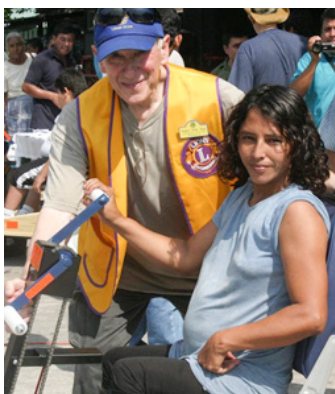
A Lion offers a Mobility Cart to a teen in Guatemala.