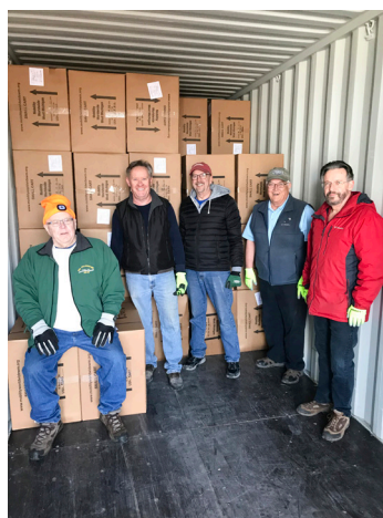
Team W Michigan takes a break while loading a cart shipment bound for DR Congo.