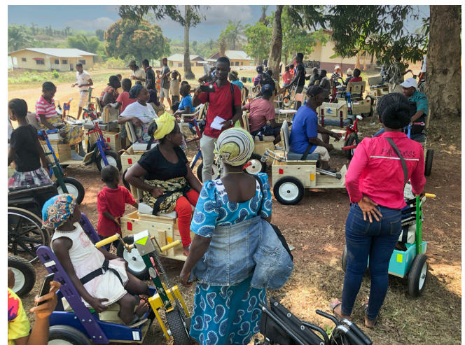
People in need of a Mobility Cart wait their turn under a shade tree during a recent distribution.