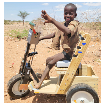
A Kenyan child enjoys his Mobility Cart.

"We would like to extend our special gratitude to Mobility Worldwide for the support you gave towards our children with special needs and disabilities. The Mobility Carts that you donated have been of great assistance to the children. They can move and stretch their elbow joints now. The carts have also strengthened the muscles of their upper limbs and improved their eye-hand coordination. They are also able to have a better sitting posture. God bless you!"