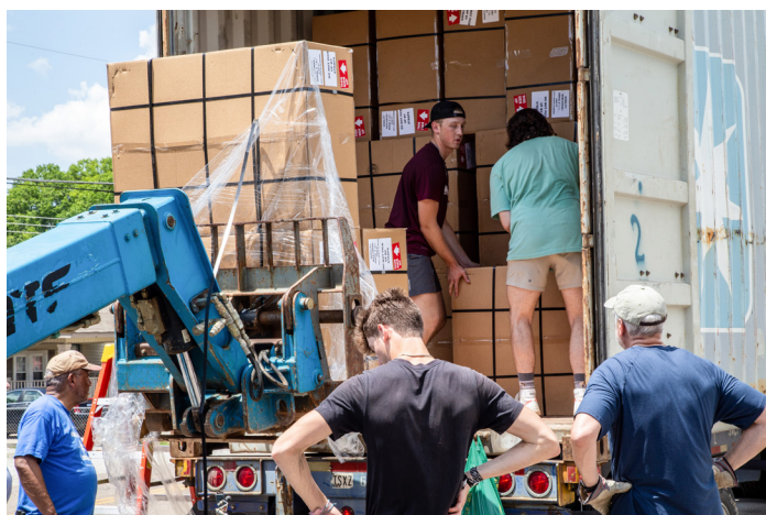
Volunteers in N. Alabama load their first full container of carts bound for Malawi & Zambia thanks to St. Mary's Catholic Church in Virginia.