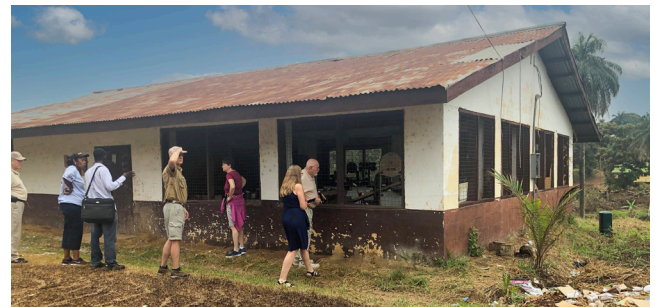
Future site of MW's Liberian workshop.

The Liberian building project will be done in time so that a visiting mission team from the US will be able to help distribute Mobility Carts there. Other duties on the mission trip will include offering educational materials to students and performing vision and health screenings.