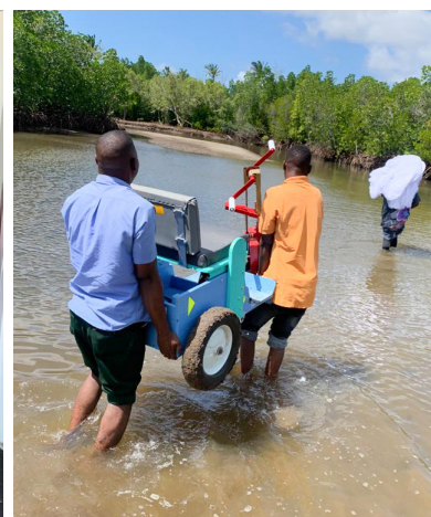
Logistics includes transportation of Mobility Carts to people in need in remote areas like Robinson Island, Kenya.