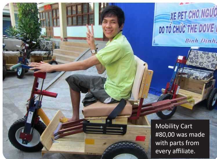
Mobility Cart #80,000 was made with parts from every affiliate.