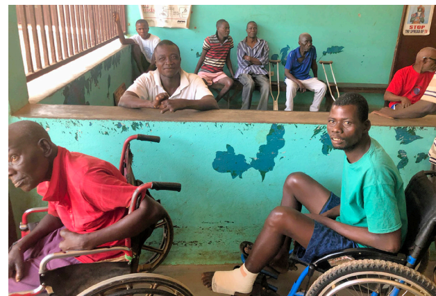
Patients await treatment at the Gbanga, Liberia Leprosy Clinic which helps distribute Mobility Carts.