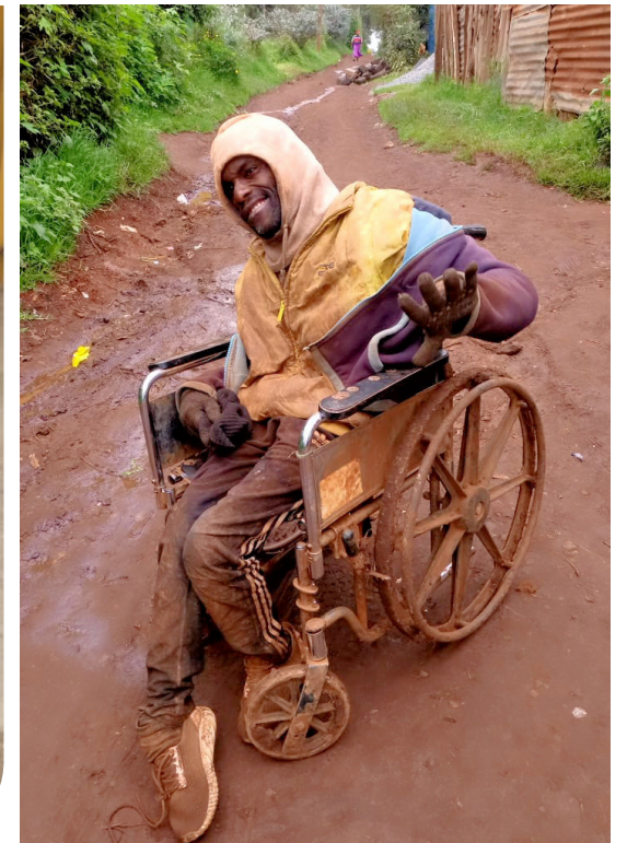
Mobility Carts are used in demanding environments like muddy roadways where wheelchairs are difficult to use.