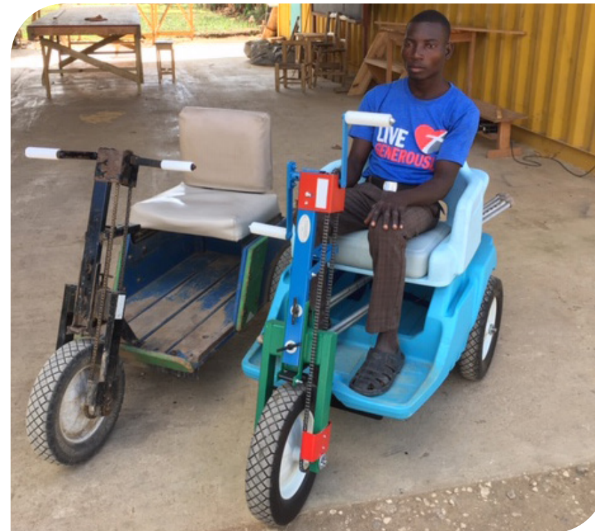
A prototype using the Mobility Cart's standard wheels and frame ready for field testing in Kenya. A Kenyan man models the new resin body with the conventional wooden body cart.

It's hoped field testing will be complete and the committee will make a recommendation to the international board of trustees in 2021.