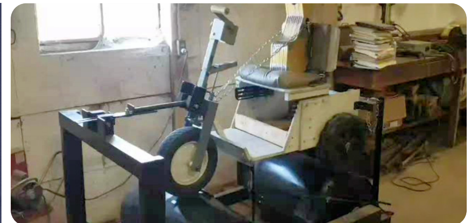
Molded resin rear wheels in an accelerated time test.