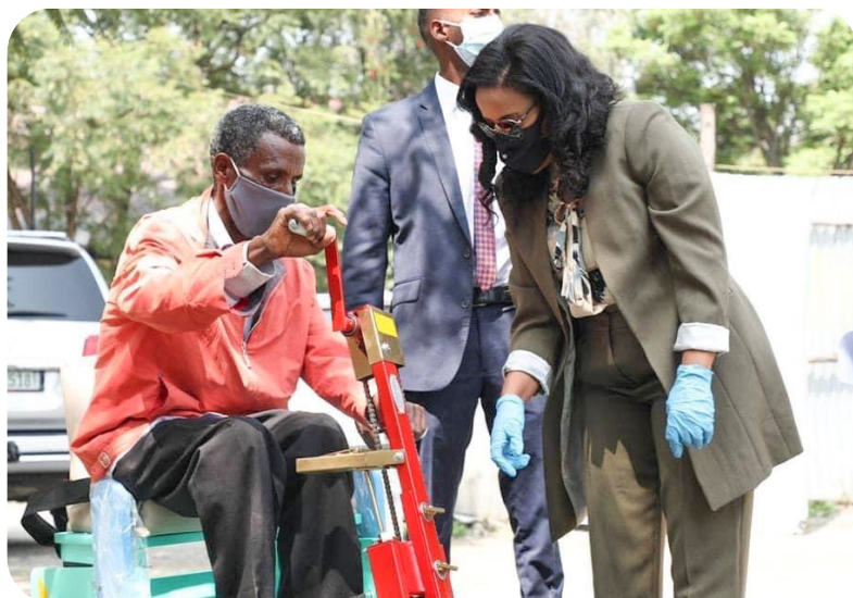
Ethiopia's First Lady braved the challenges brought on by the pandemic, to help people obtain mobility.