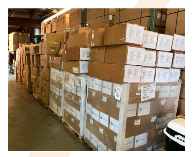
Warehouse waiting for outgoing shipments 2017.

expansion . (Pictured: Black banded, boxed carts are stacked high in the back on industrial shelving.)