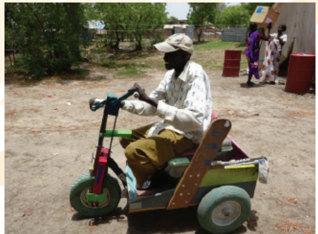
Man affected by leprosy received a cart thru ASMP in May 2015.