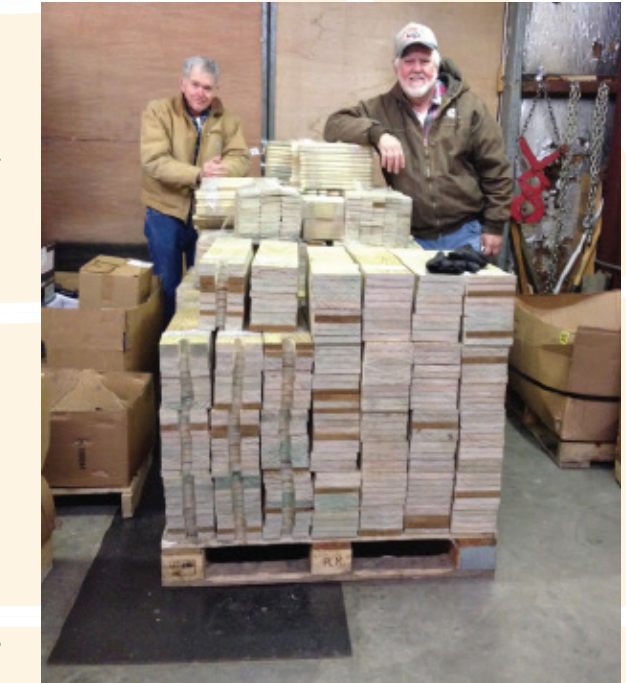
Caption: Picture of Warrensburg Team with their wood delivery in 2014.