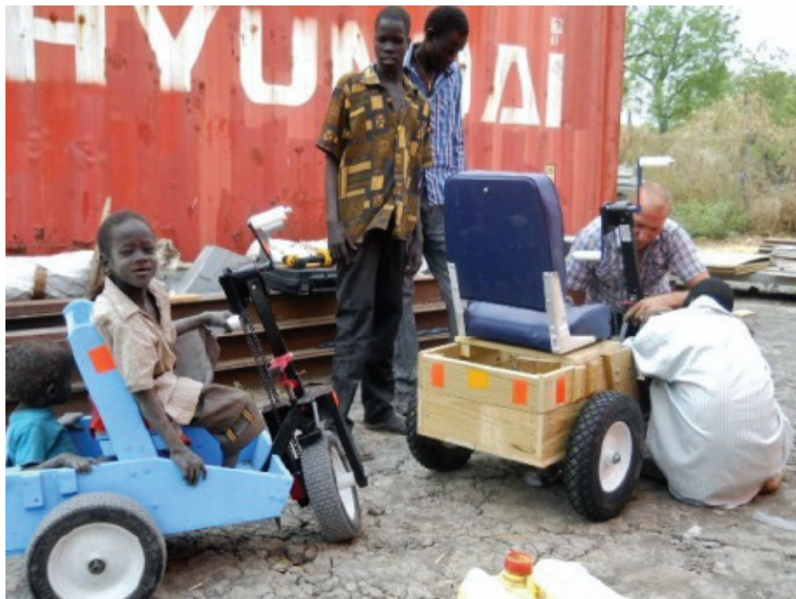
2012 Boy on small cart watches as another one is assembled in South Sudan.

“Can’t believe you have crutches! They have been asking me for crutches in Kenya. What a blessing! Any date is good for us. We can use all the Mobility Carts we can get. And people love the Pull carts! Let me check on the mix they want, but I know whatever mix you give us we distribute every one of them!