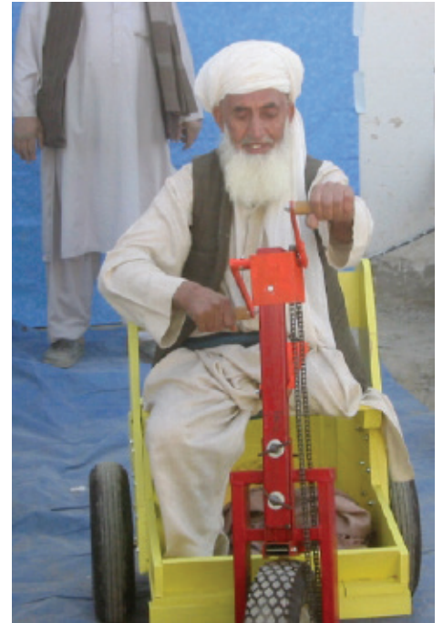
Afghan man receives the first cart in that country in 2003 after 9/11.