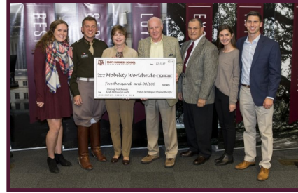
MW Board Members receive $5,000 check from Strategic Philanthropy Class