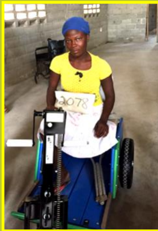
After 15 years of depending on others or dragging herself through the dirt, 22 year old Florvilus now can get around independently.