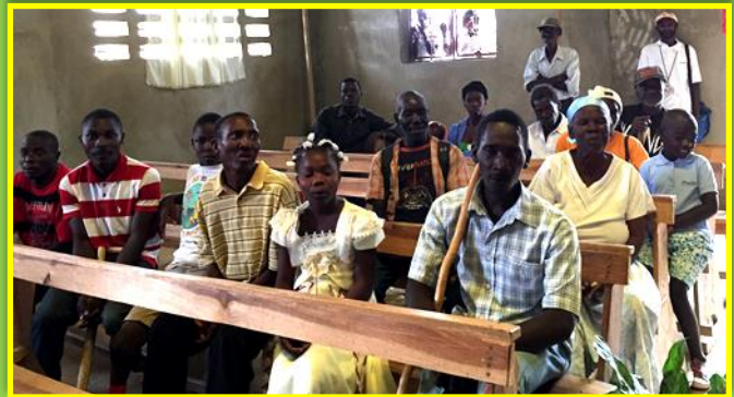
Recipients waiting for carts in Haiti February 2017.