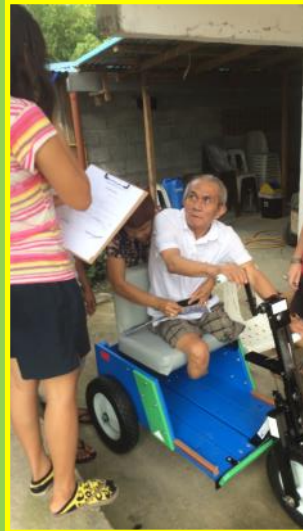
Recipient in Tacloban in the Philippines —distributed through Orphan Grain Train

MOBILITY OCCUPATION COMMUNITY EDUCATION DIGNITY