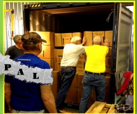
Loading a full container of 183 carts on April 25, 2017 to be shipped to United Missions in Nepal.