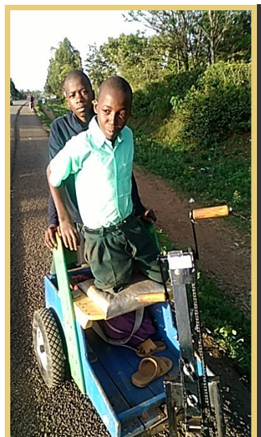
School boy still on the road

OUR MISSION To reflect the love of Jesus by bringing mobility and dignity to those unable to walk