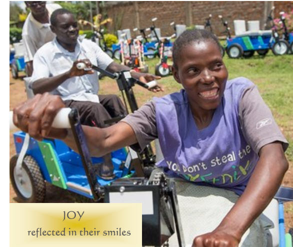
JOY reflected in their smiles