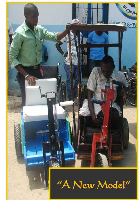
"A New Model"