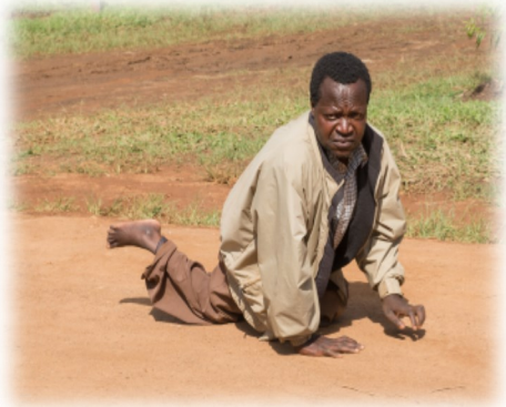
Second CRC Pella

70 + million people worldwide are leg disabled due to birth defects, disease & accidents. Without the HOPE of a PET cart they crawl in the dirt.