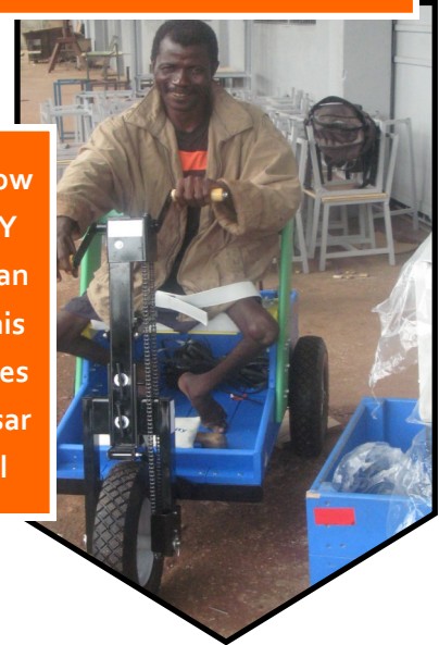
He is now HAPPY as he can bring his cutlasses to Lunsar to sell