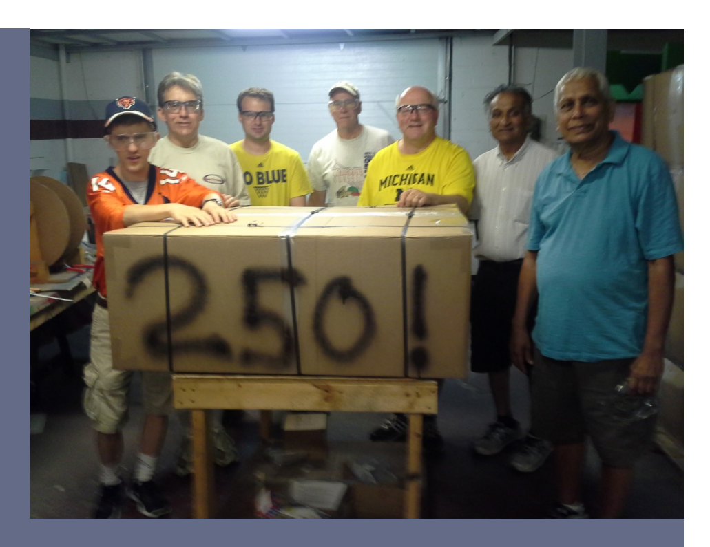
Volunteers celebrating the 250th Mobility Cart made by our shop

M.W. MI-Saline's workshop is located in nearby Milan, MI.