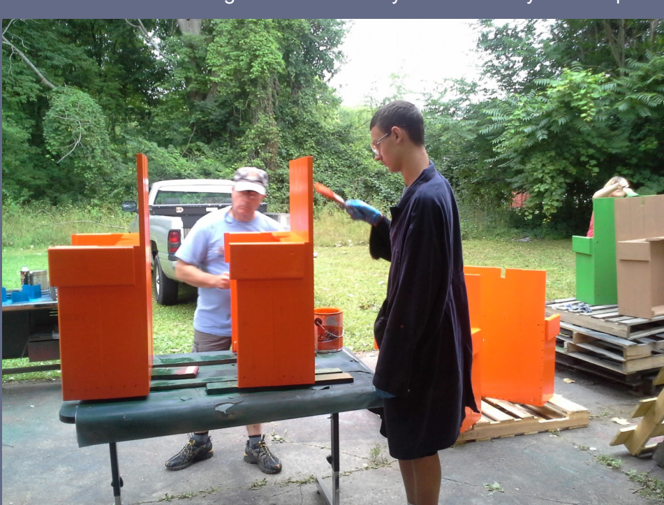
Volunteers from Walled Lake paint wooden boxes for the Carts.