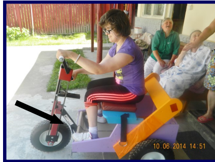
Happiness Is . . . Having a PET Change Your Life!

Brezo, Romania — The following email was received on June 12, 2014. It was written by a priest who received 2 PET carts made by our shop.