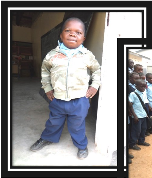
School children watch their 27 yr. old classmate as he tries out his new PET.