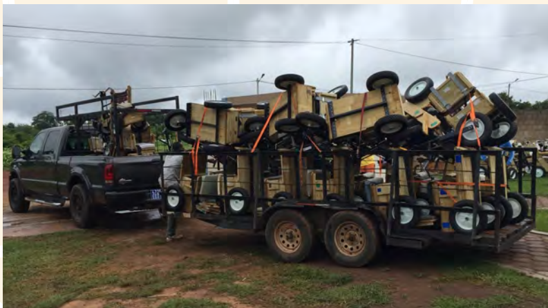
Loading up assembled carts for distribution

We stayed at the 1040i Tanda school facility where some 170 boxed Mobility Carts awaited us, ready to be un-packed, assembled, and then distributed. Over the first three days, we assembled and checked all 170 carts. This involved an intense effort by local volunteers, 1040i local staff, and some of the other team members. In the end, we had as many as 6 two person teams all building at once. Story continues on page 2.