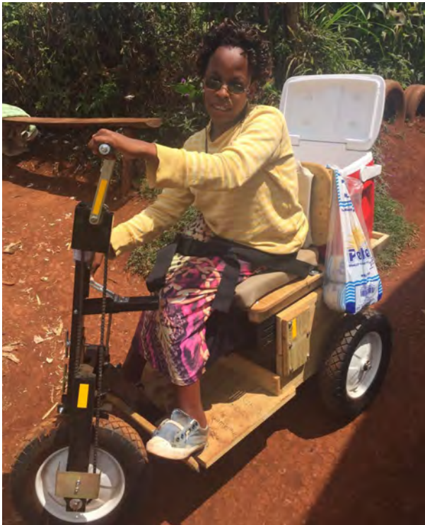
Mobility Cart with mini-mart in Kenya