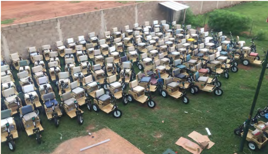
Assemblers build 170 carts in just three days

OUR SHOP INVENTORY VOLUNTEER TRAVELED TO COTE D'IVOIRE TO DISTRIBUTE MORE MOBILITY