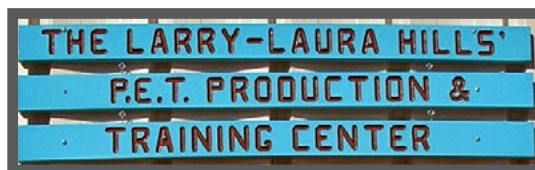
When the new warehouse opened at Penney Farms in 2008, this sign was on the building.