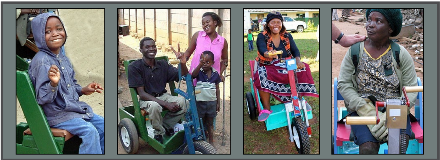
The happy faces of mobility cart recipients—children, families, individuals. Thank you for your part in providing hope for those in the world needing it.

Please make checks payable to Mobility Worldwide FL–Penney Farms.