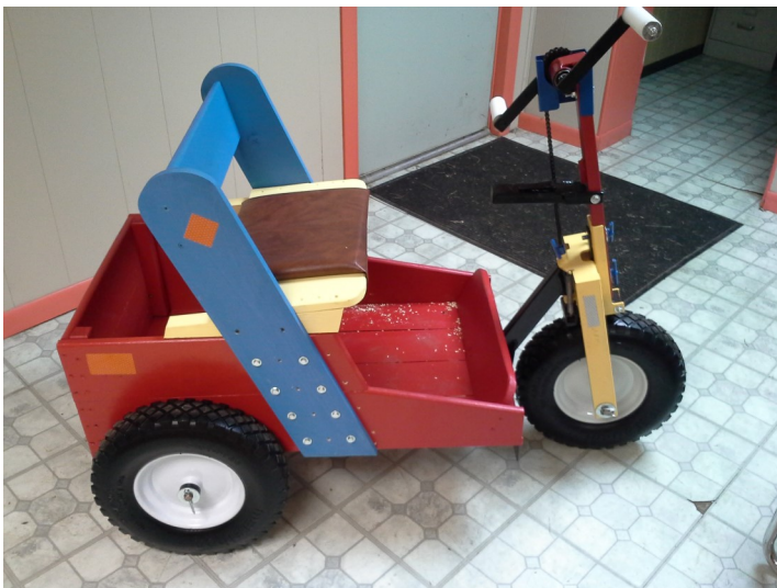
This is a PET made by PET MI-Saline

“There are in excess of 20 million people in developing countries unable to walk . All Affiliates, parts-makers, financial supporters, distribution partners and others engaged in the ministry of the PET Project are asked to consider, prayerfully and earnestly, the extent to which they can contribute ...”