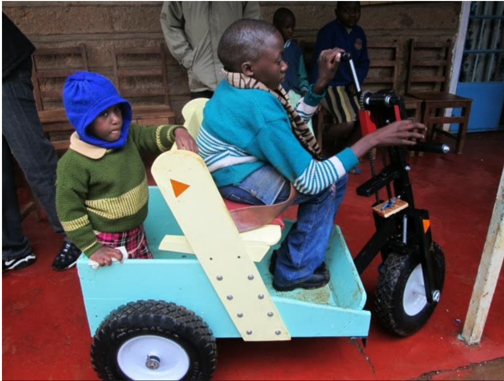
A PET recipient