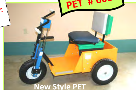
New Style PET