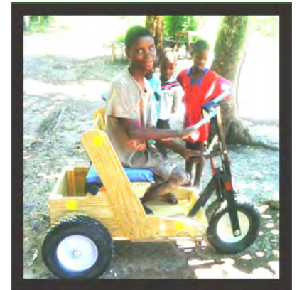
Matino's smile says it all!

parts several times. This past September Matino traded his